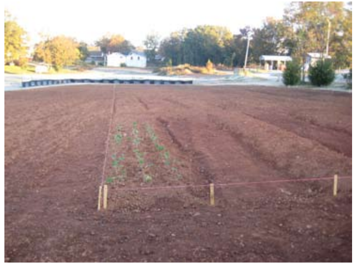
Strawberry Plants growing in the garden compliments of Hunter Farms

On October 10, 2011 Easley City Council passed a resolution establishing a Community Garden. You might wonder what a community garden is and what is its purpose? A community garden is nothing more than a piece of land gardened by a group of volunteers. The purpose of the garden is to help address the hunger issue in Easley and Pickens County.