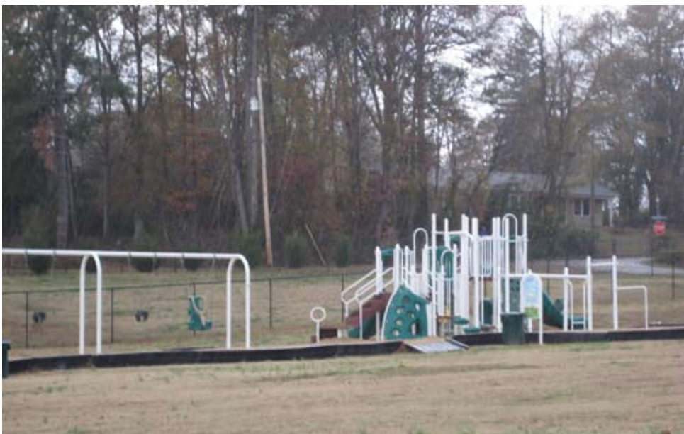
Now you can have fun with your children and your pets at Hagood Park