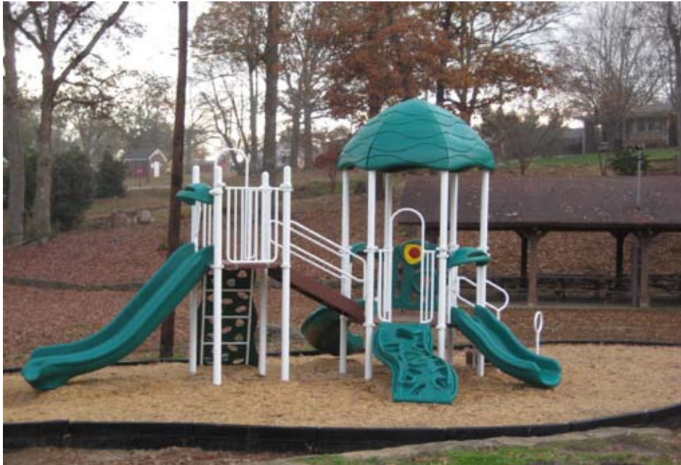
New playground equipment at Hagood Park