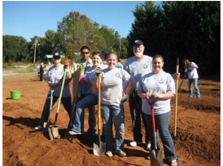
Americorp group volunteering on Make a Difference Day on November 5th