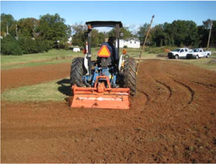
Public Works doing the initial grading