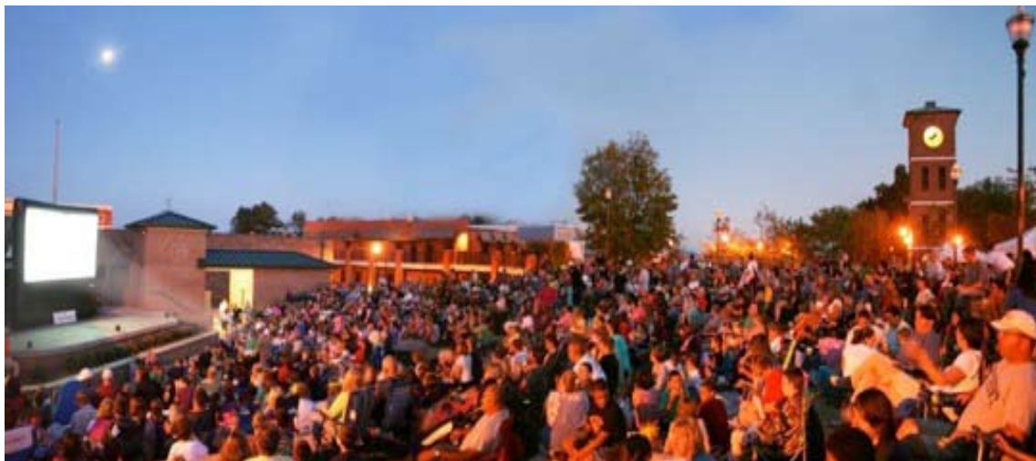
Movies on the Market

To book the amphitheatre call the Easley Parks and Recreation Department at 855-7933.