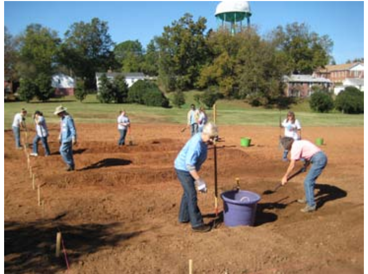
Master Gardeners lending a helping hand.