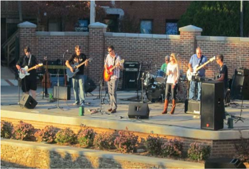
SunLit Moon provided entertainment at a fundraiser for Meals On Wheels.

October 6th marked the grand opening of the new Amphitheater in Old Market Square. It is an all-purpose outdoor event amphitheater open for community events. There have already been numerous events held in the amphitheater. The City held its "Movies on the Market" series in the new amphitheater to an overflowing audience. Other fall events held in the amphitheater included the Easley High School Food fight and a fundraiser for Meals on Wheels and the annual Halloween Festival. In the spring the City's Music on the Market will be held in the amphitheater.