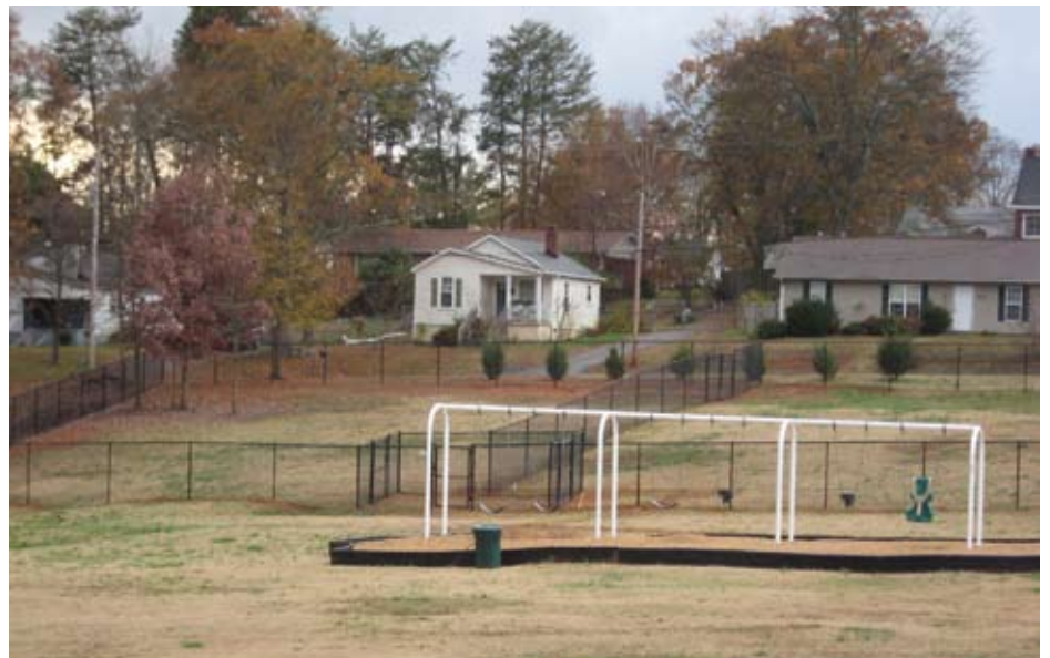
New Dog Park Area at Hagood Park